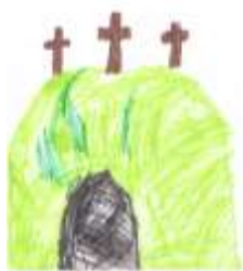
Yau Yau, aged 5