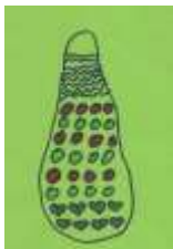
Grace, aged 7