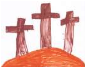
Bertie, aged 8