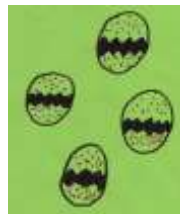
Roisin, aged 6