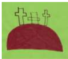
Bobby, aged 7