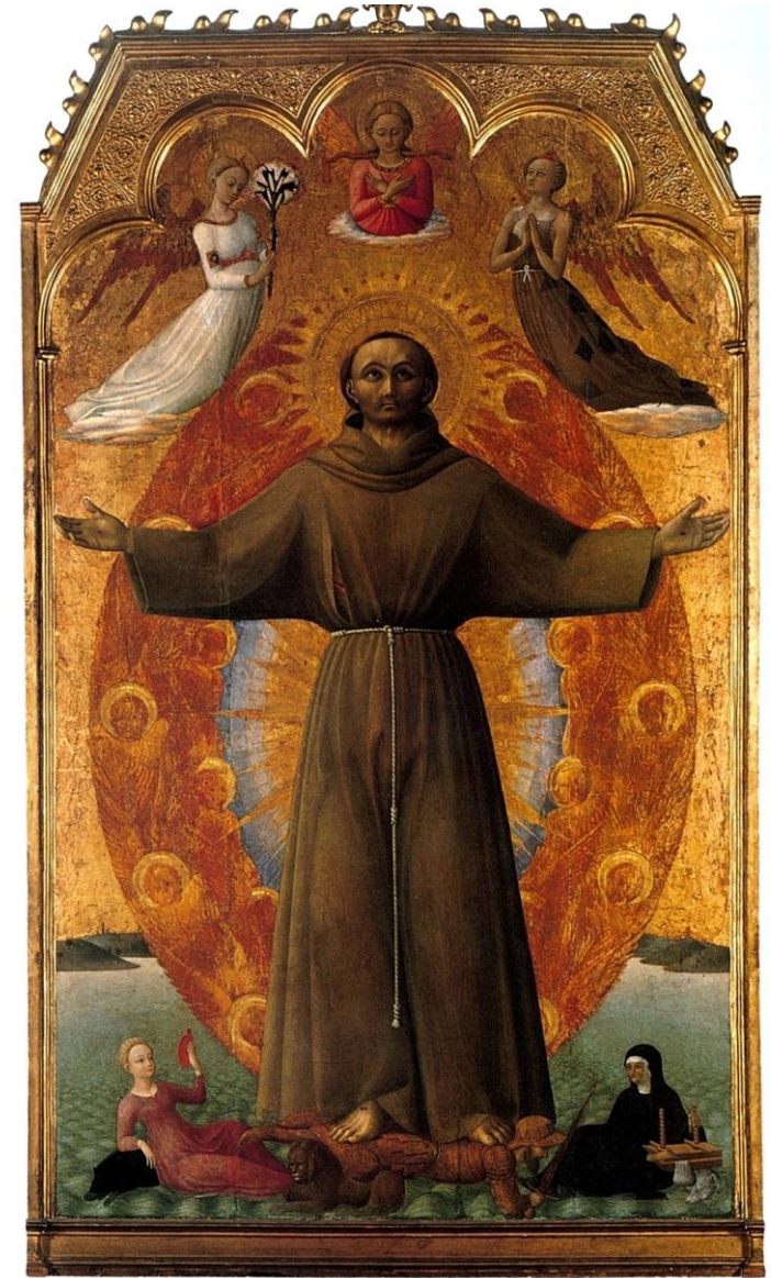
(The Ecstasy of St Francis by Stefano di Giovanni)

O Divine Master, Grant that I may not so much seek To be consoled as to console; To be understood as to understand; To be loved as to love. For it is in giving that we receive; It is in pardoning that we are pardoned; And it is in dying that we are born to eternal life.