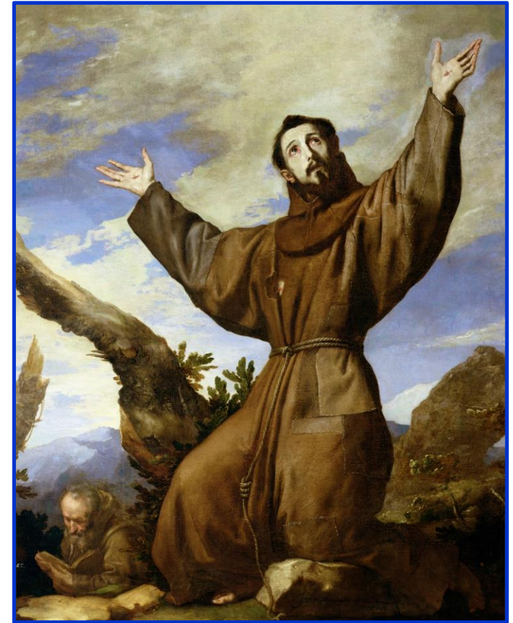
St Francis by Jusepe de Ribera

Francis' father was angry that his son had stolen his cloth. He summoned Francis to appear before the Bishop. Francis repaid the debt to his father and also took off all his clothes and presented them to him. The Bishop then clothed Francis in an old tunic. Francis then said that he now had only one father, his Father in heaven. He dedicated his life to the service of God, taking a vow of poverty, inspired by the rule of the apostles in the Gospel of Matthew.